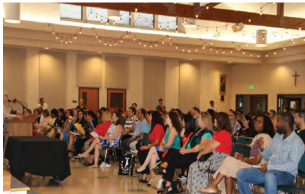
Grill Hall was packed with parents listening intently to learn more about the school-home partnership and the educational expectations for their children and families.