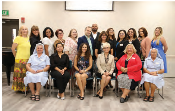
Teachers and staff pose for a group photo prior to Back to School Night. After the meeting they met with parents in the classrooms to help foster the parent-teacher partnership and provide a preview of the school year.