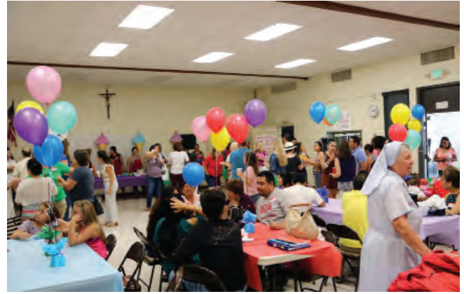
SJE families got together for the annual "Ice Cream Social" held during the first week of school to allow parents, students, teachers and staff to get to know each other a little better. It was a sweet way to socialize!

YOUR CHILDREN, OUR STUDENTS, NEED PARENTS AND EDUCATORS TO PROVIDE INSPIRATION, IMAGINATION, JOY, OPTIMISM, HUMOR, LOVE, SUPPORT, FIRMNESS, SAFETY, CLEAR VALUES, AND—PERHAPS MOST IMPORTANT—RESPECT. WITH OUR COLLECTIVE SUPPORT, OUR CHILDREN'S YOUTHFUL ASPIRATIONS CAN SOAR INTO ADULT ACCOMPLISHMENT.