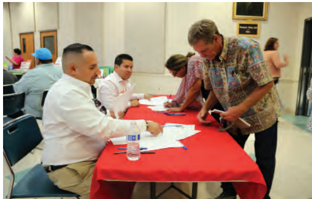
PTSO Executive Council members check in parents as they arrive at Back to School Night. The PTSO has a number of great events planned for the year.

A special thanks to our Room Parents who provided the refreshments for the night!