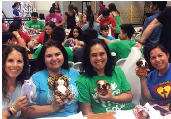
SJE NJHS members, classmates, teachers, and their families join in wrapping toys for the holidays to be given to needy families around the world.

We invite everyone to join in the spirit of Catholic Schools Week and celebrate all the great things our students at St. John Eudes School and all our Catholic schools are doing!