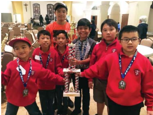
Members of the SJE Chess Team hold up their trophy for winning top honors at the Catholic Schools Fall Chess Tournament. The trophy was awarded for the most checkmates by a chess team at St. Charles Borromeo Church (North Hollywood) and included teams from 17 Catholic schools.

Congratulations to the SJE Kindergarten which had the greatest average total Jog-A-Thon pledges and also had 100% participation in the event! The Kindergartners were rewarded with an entire week of free dress, a pizza lunch, and