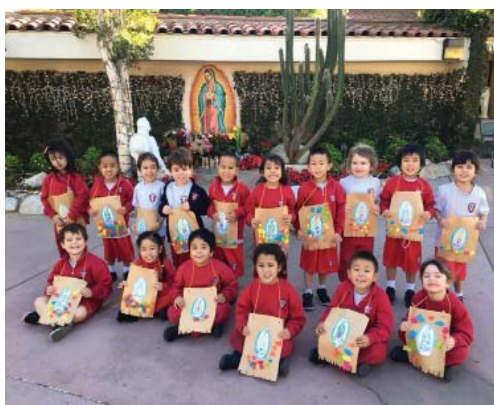
With the beautiful mosaic of Our Lady of Guadalupe adorning our plaza, the celebration of her feastday (Dec. 12) has a special significance at St. John Eudes. Not only does our Spanish Ministry celebrate the day with a special mass, mariachis, and other events, but our school children get in on the celebration also. Even the TKers made their own tilmas depicting our Lady of Guadalupe. It was a great way for them to learn about this special feastday of the Patroness of the Americas!