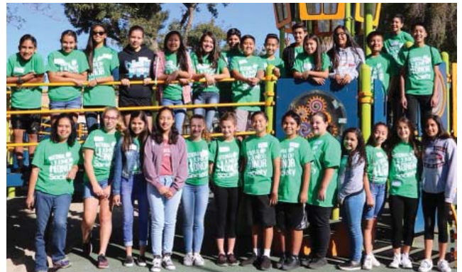
Posing on playground equipment, SJE NJHS members took part in a special play day for children with disabilities. They made new friends and learned a lot about acceptance and compassion.