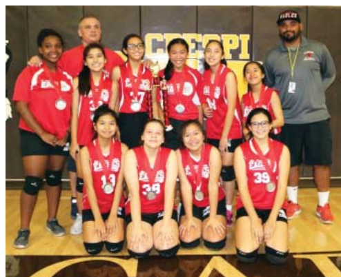
Congratulations to the Girls A Volleyball Team which played a very strong team from St. Paschal Baylon Catholic School at the Valley Catholic Sports League's championship game and took 2nd Place in the league competition. They had a great season! Go Eagles!

Author Day is a wonderful way for students to learn about writing and literature by interacting with a distinguished author. Our students recently had