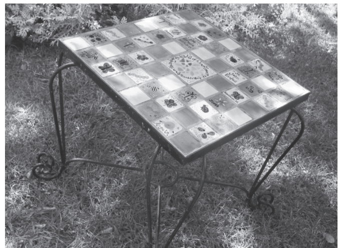
Left - High rollers take a moment from casino games to pose for this picture at last year's Spring Fundraiser. In addition to the casino games, there will be prizes, silent and live auctions, dancing, the Grand Prize Drawing and much more! Right - Class keepsakes, like this outdoor table decorated with class memories and student names, will be the featured items during the live auction. They are treasured by parents and students as reminders of the wonderful spirit of community at SJE School.