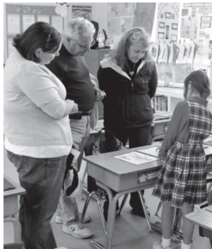
Visitors to the SJE Open House are treated to displays of student work and learn about the wonderful achievements of our students.